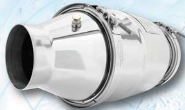
MINE-X ® Catalytic Converter