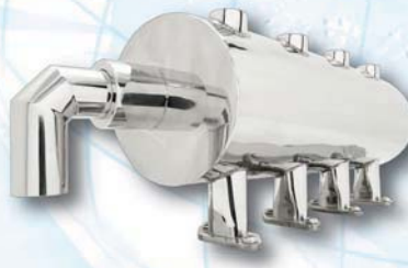
MINE-X ® Catalytic Muffler