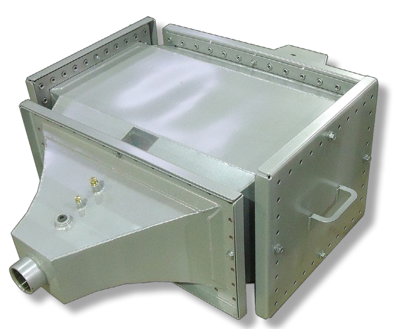
DCL's SRT System is an advanced gas pre-treatment and purification system that is designed to remove harmful siloxanes from the gas supply.

With DCL's SRT System, treated biogas can lead to substantially higher income for plant operators.