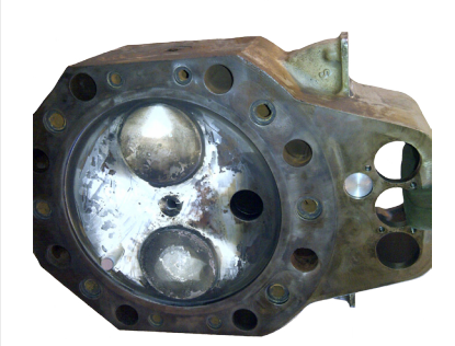
Abrasion and wear