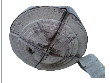
Coating and plugging of valves, spark plugs, pistons, cylinder heads and catalytic converters